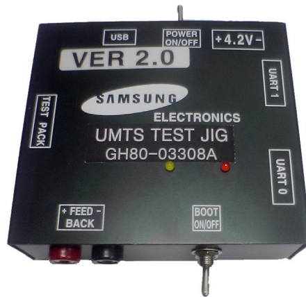
Test Jig (GH80-03308A)