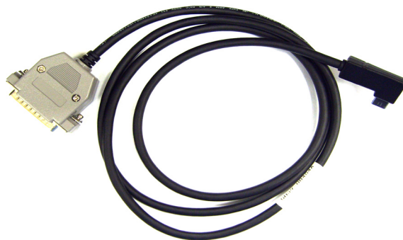
Test Cable (GH39-00478A)