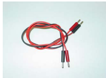
Power Supply Cable