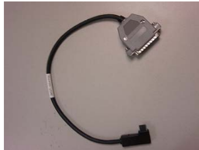
Power Supply Cable