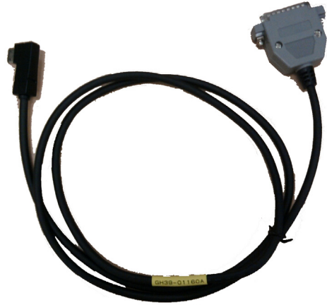
Test Cable (GH39-01160A)