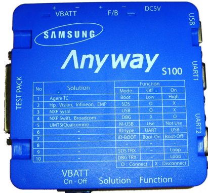
Test Jig (GH99-36900A)