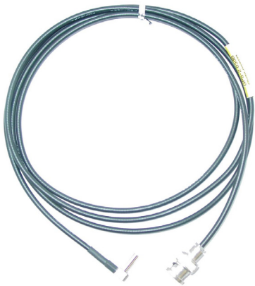
RF Test Cable (GH39-00985A)